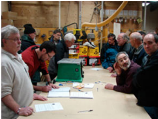
Members ready for the start of a demo