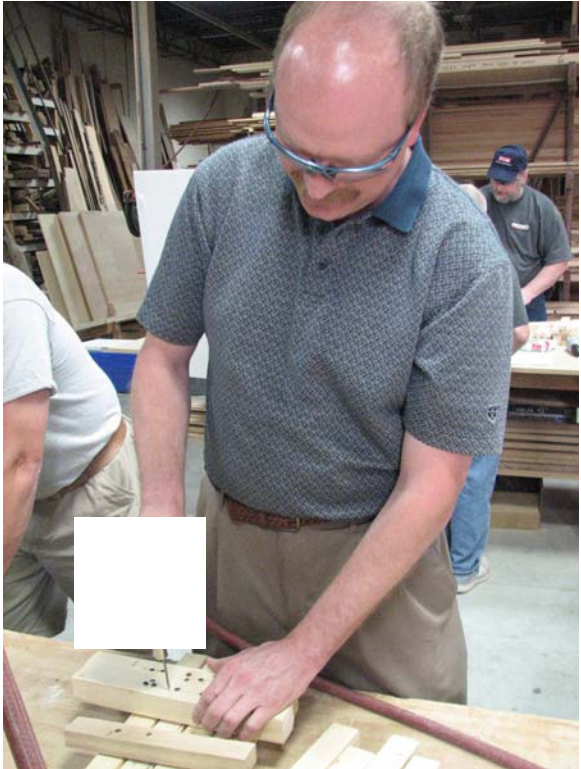
Testing one of many nailers we can't show you

angled pin nailer brad nailer 23 gauge nailer 18 gauge nailer 18 gauge stapler