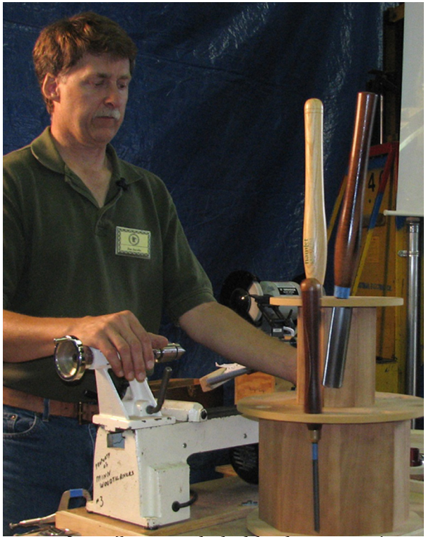
Lazy Susan style holder keeps turning tools within easy reach

This guarantees you'll be turning as fast as you can.