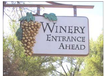
each grape hand turned

presentations to clients and allows any necessary changes before work begins. These photographs from a cd rom show the results.