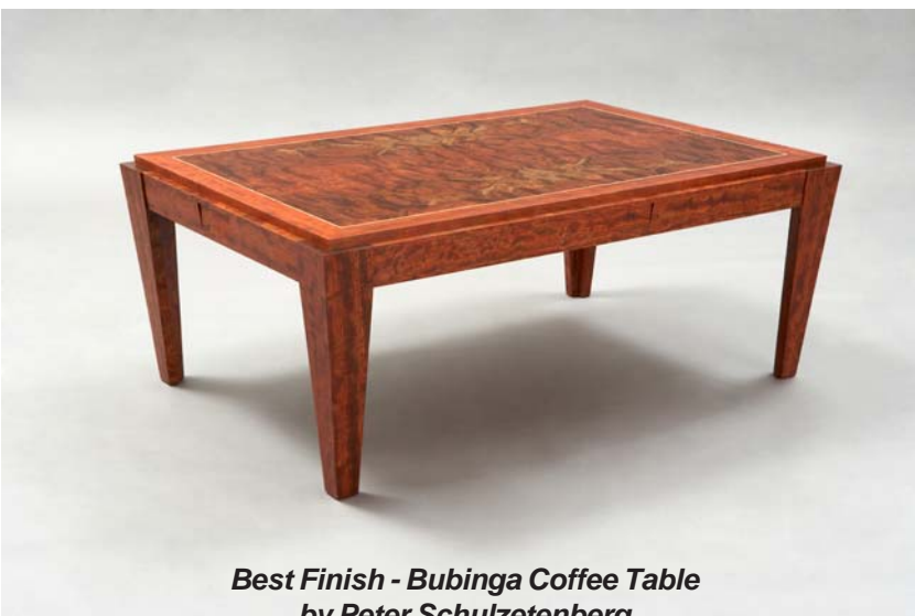
Best Finish - Bubinga Coffee Table by Peter Schulzetenberg