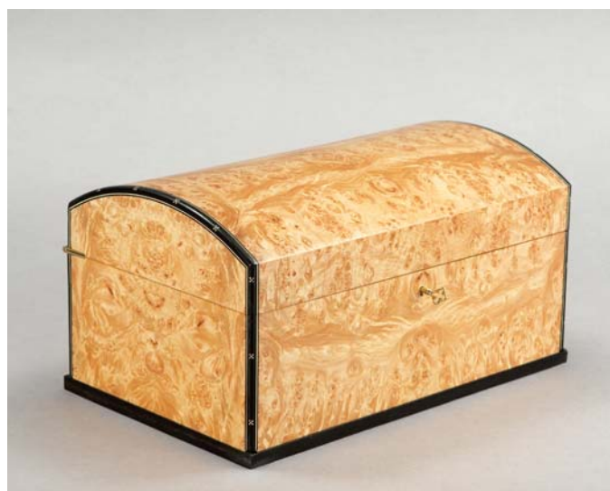
Best Detail - Carved Top Jewelry Box by Rutager West