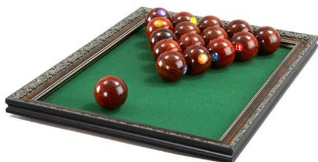
Best Turning - Behind the Eight Ball by Tim Heil