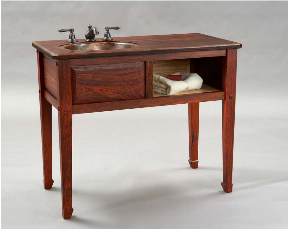
Best in Show - 2008 Northern Woods by - Lee Toman