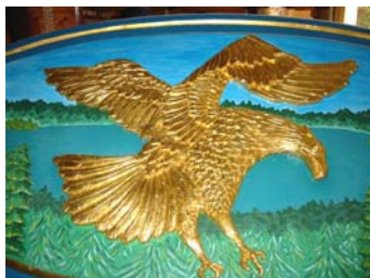
gilded eagle on sign above

To make the signs durable(nearly always they are exposed to the elements), David uses mahogany, white oak, marine plywood, and high density polyurethane board called Sign Foam. For glue, it's epoxy. Outdoor sign primers and enamels wear well with minimal fading, a necessity since their work is very colorful.