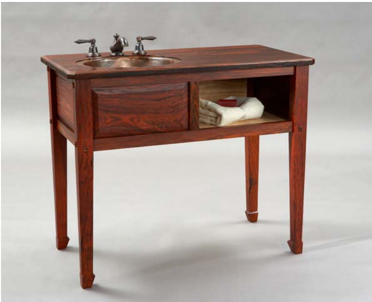
Best in Show - Bathroom Vanity by Lee Toman