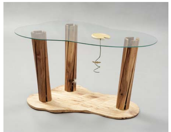
Best Carving - End Table by Bob Kraby