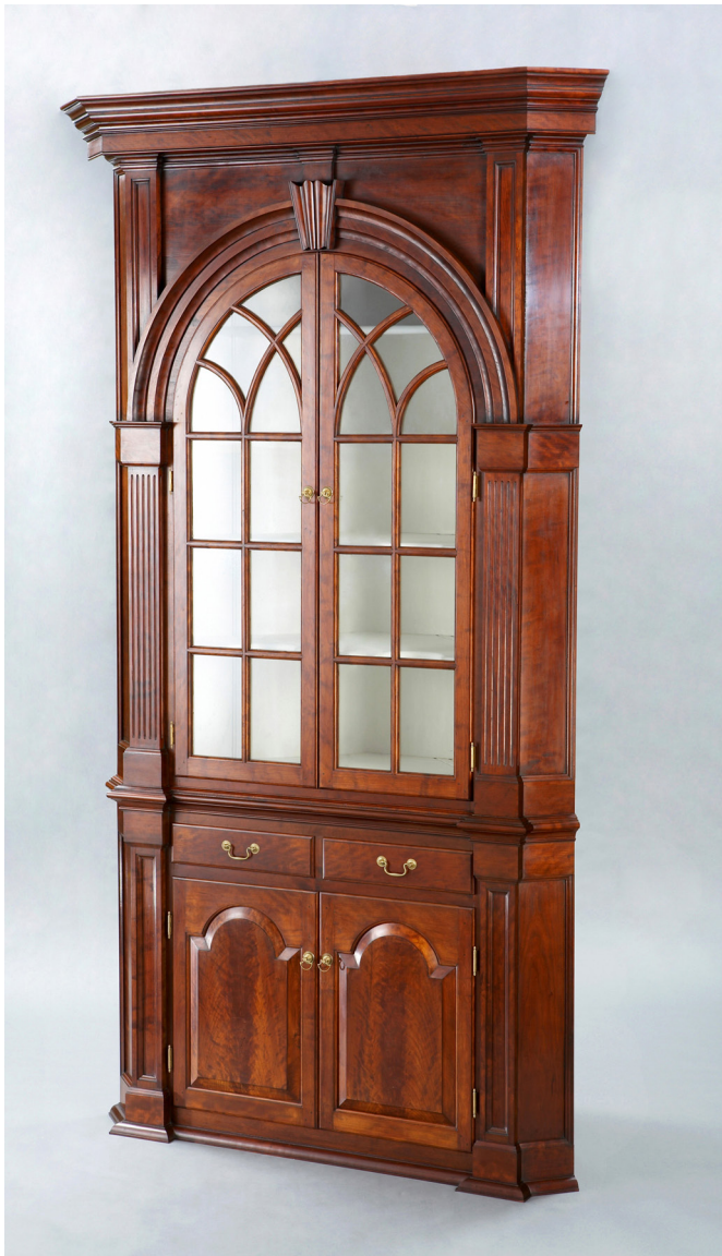
This reproduction of an 18th Century Corner Cupboard by Joel Ficke wins Best Traditional Piece.