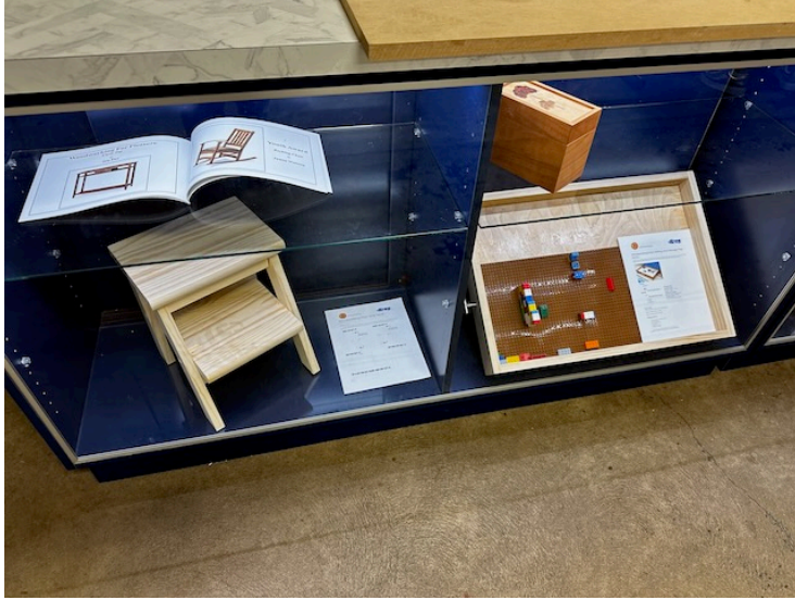
Display Case at the State Fair